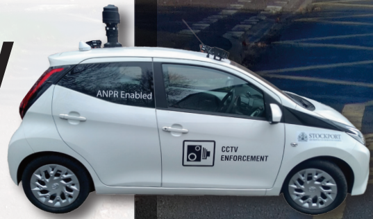
▲ School Parking Camera Car

In 2018, 30 children were injured on Stockport's roads.